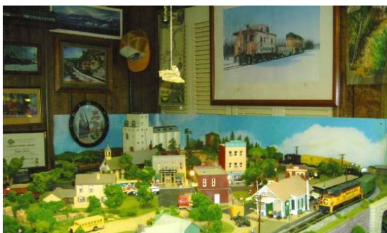
Part of the train room display.

1950s Pop Culture Favorite songs in HS: "Catch a Falling Star," "The Great Pretender," "Wake Up, Little Susie," "Young Love," "Four Walls" Favorite singers in HS: Teresa Brewer, Eddy Arnold, Hank Williams, Patti Page, Marty Robbins, Johnny Cash—still like them all!